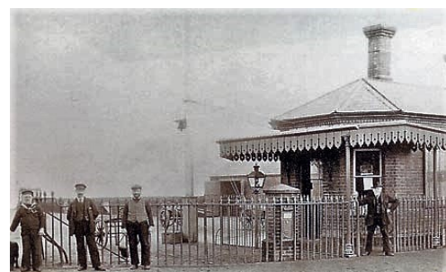
Hythe Pier Toll house circa late 1890's

Our Community Working Together to bring our Heritage and History to life info@hythepierha.org.uk