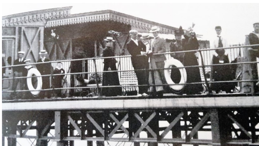
Pier Head scene early 1890's