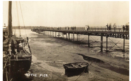
Hythe Pier around the turn of the century