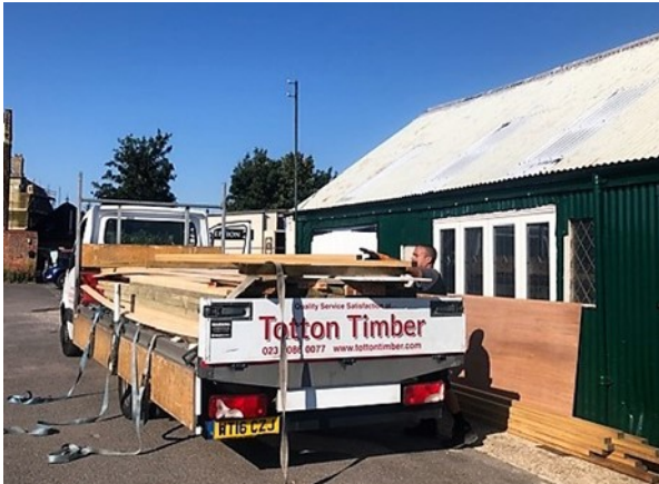
Timber arrives at the Men's Shed