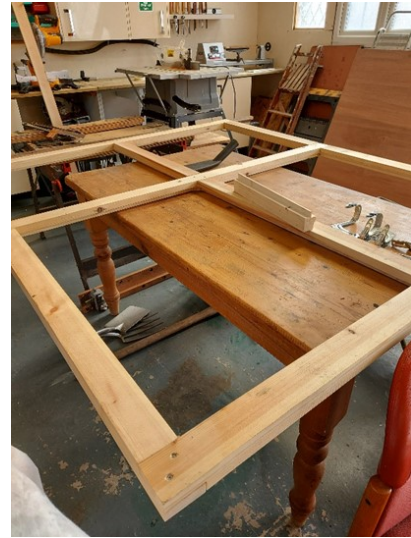
Soft wood trial frame built early July