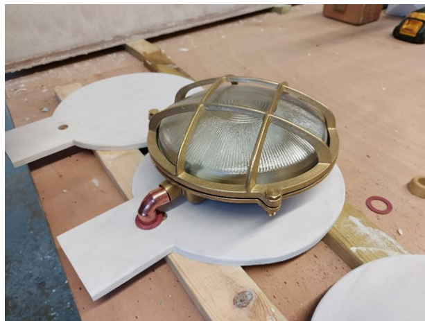
Above left: Backing boards for lighting units and Above right: Lighting unit loose assembled at the Shed (at the Pier)