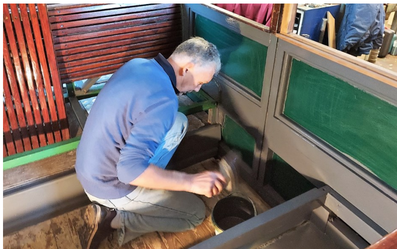
Priming of interior woodwork continues