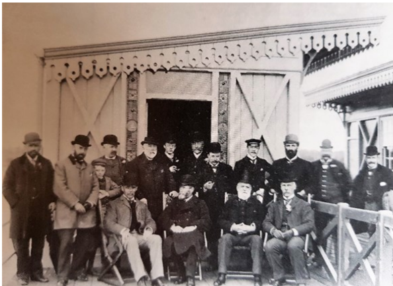
Official party for trial trip including second right