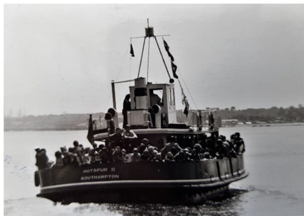
Hotspur II decorated and full

Free rides all day were offered to celebrate 400 years of the Hythe Ferry. Saxton's 1575 Map of Hampshire refers to the "Hitheferye", a somewhat tenuous link which turned into a resounding success. In all, 7678 single journeys were recorded. The weather was warm and sunny throughout the day. Hotspurs II, III and IV made many off the trips fully laden. Both boats and pier were decorated with flags and bunting.