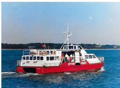
Great Expectations 1999

Whilst a fuss was made of the old war horse, her successor, Great Expectations, arrived quietly and took over the role of the main boat, relegating Hotspur IV to stand-by. Hotspur IV survived on the passage for another 18 years.