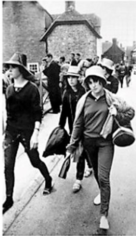
Beatniks in Beaulieu High Street 1960