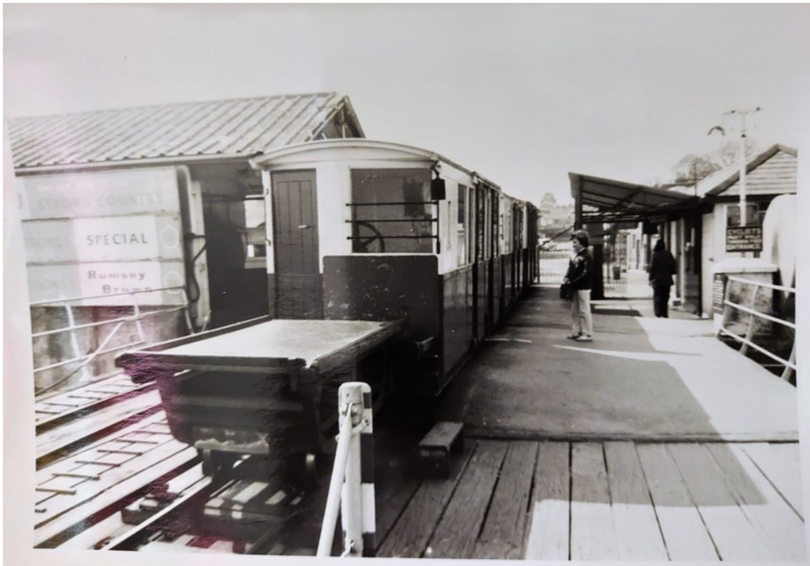
The train 1974

Our pier train found itself in the midst of a controversy when the then owners of the ferry, pier and train, the General Estates Company restricted its use to ferry passengers only. Throughout the summer regular ferry passengers had often had to walk the pier as seats were taken on the train by promenaders and tourists. The move proved unpopular and the parish council was flooded with complaints. Reports of elderly people being refused access if they were not in possession of a valid ferry ticket prompted the council to take up the issue with the owners. The situation rumbled on into the autumn of the following year when it appears to have simply passed into history.